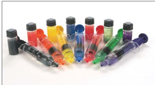
Figure 4. Embozene™ Color-Advanced Microspheres.

bration is lost. What ultimately matters is the size and volume of the particles exiting the microcatheter and flowing into the blood stream and occluding vessels.