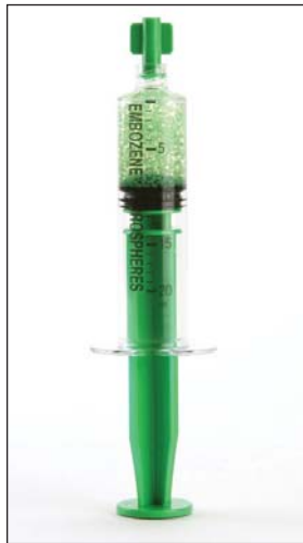
Figure 3. Embozene™ Microspheres can maintain their suspension indefinitely.

Finally, if during injection through the microcatheter the particles fragment or do not rebound, the reason for cali-